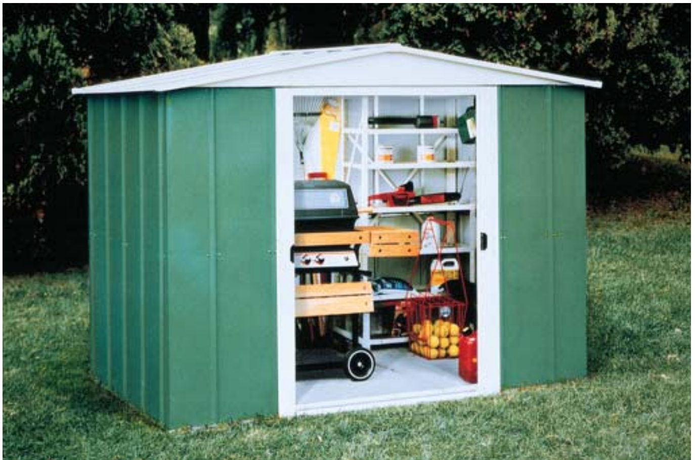
8x7 Apex Roof