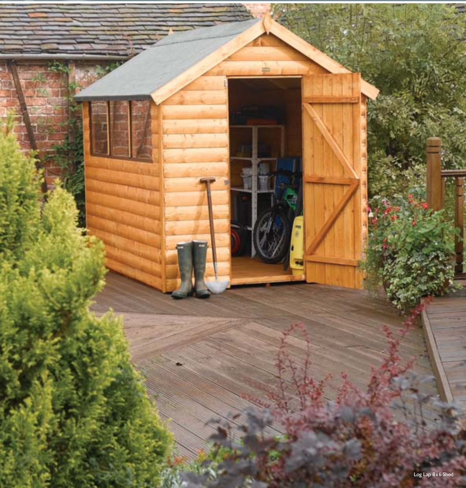
Log Lap 8x6 Shed

Storage solutions can often be difficult to find for many of those awkward shaped garden implements, bags of compost, toys, bikes. We have every shape and size to fit the bill. All our timber sheds have a dipped honey-brown finish.