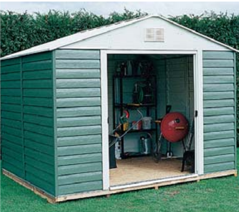
10x8 Apex Roof