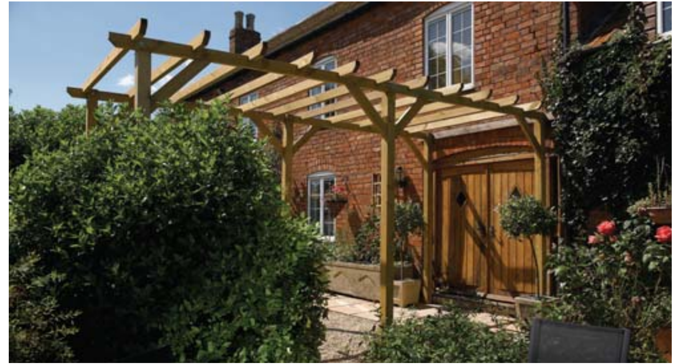
Traditional Pergola with Extension 1 2