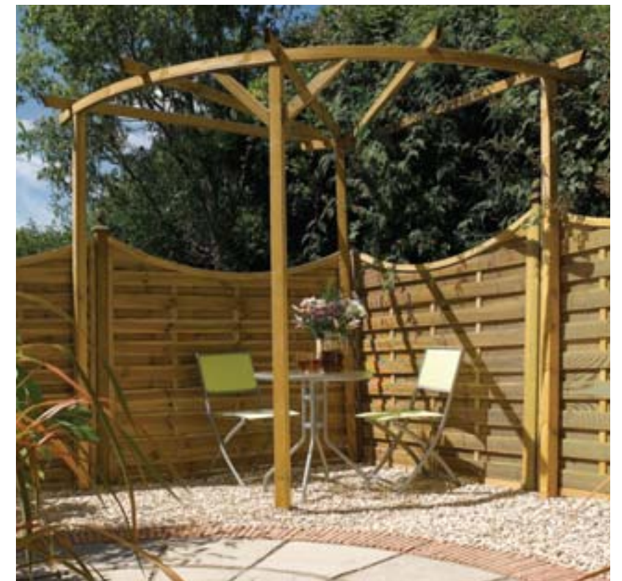
Corner Pergola 3